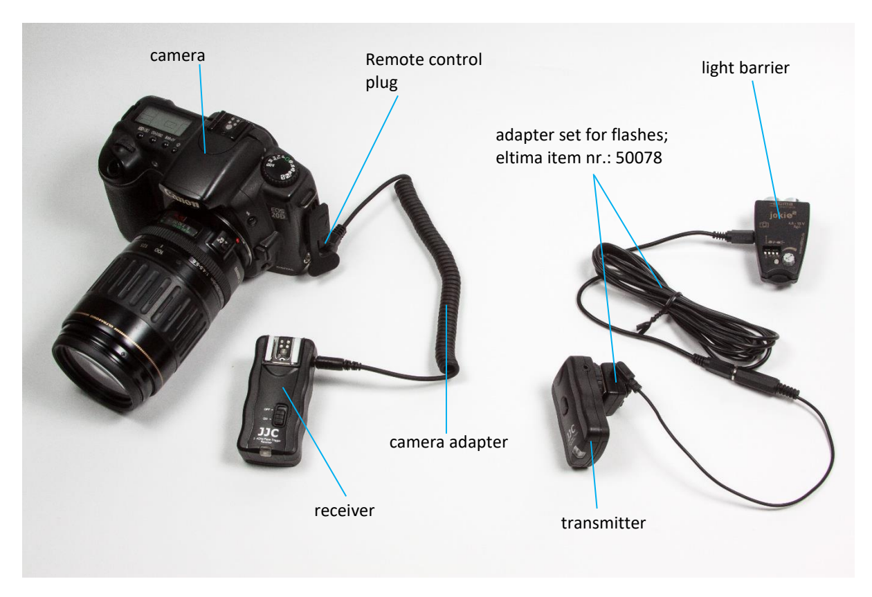
Figure 1: Connecting a camera via radio remote control

A flash radio remote control usually consists of a transmitter and a receiver. The transmitter is connected to the light barrier, the receiver to the camera.